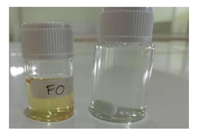
Figure 1. Nanoemulsion appearance of the optimum formula of SNEDDS naringenin

nanoemulsions, it can be concluded that the optimum formula nanoemulsion is in grade A (the system forms nanoemulsions quickly < 1 minute with a clear appearance).